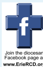
Join the diocesan Facebook page at www.ErieRCD.org